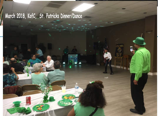
March 2018, Kofc, St. Patricks Dinner/Dance